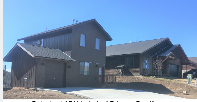
Detached ADU to Left of Primary Dwelling