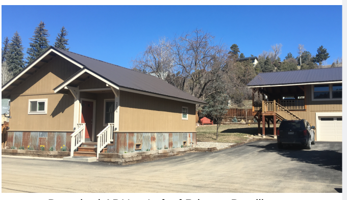
Detached ADU to Left of Primary Dwelling