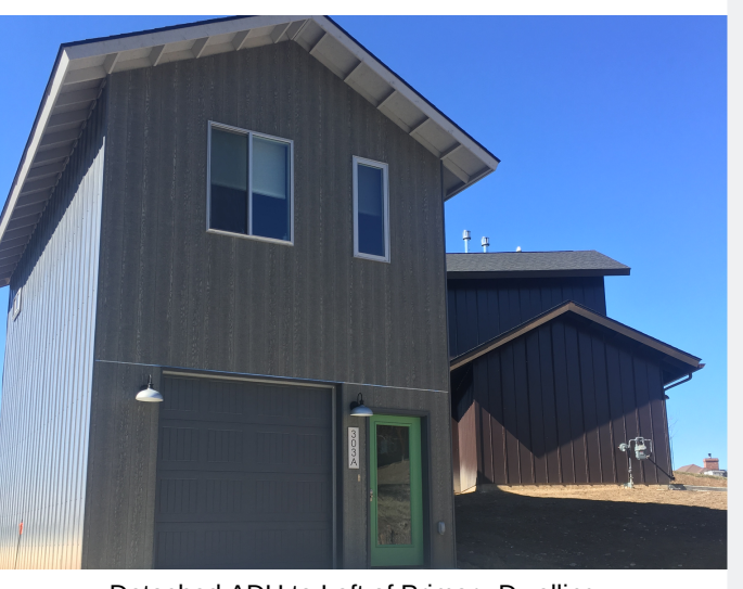
Detached ADU to Left of Primary Dwelling