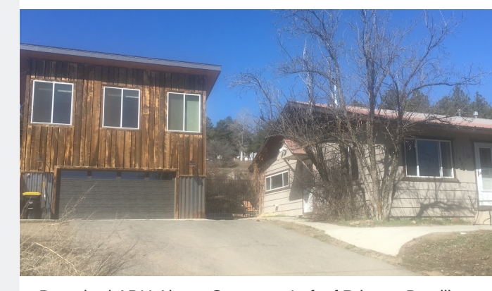
Detached ADU Above Garage to Left of Primary Dwelling