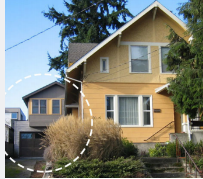
Attached ADU Above Garage to Left of Primary Dwelling

Please see our Building Design Criteria handout located on our website https://www.pagosasprings.co.gov under the Department of Building and Fire Safety.